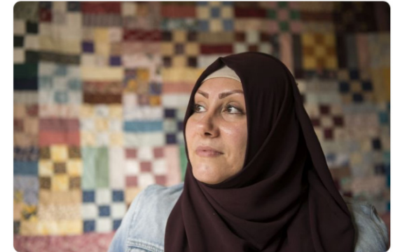
7:00 PM - 7 Dec 2018

“When I came to Save the Children’s refuge, I saw a different world. There was no stress, less thinking about everything. For my child it was really good because other children were there too. It felt like family.” #16days #hearmetoo #orangetheworld