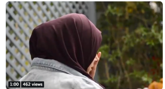
4:05 PM - 24 Nov 2018

It's International Day for the Elimination of Violence Against Women, which kicks off #16days of activism to support and empower survivors. Join the global campaign with @UN_Women to help end violence against women and children. #orangetheworld #HearMeToo