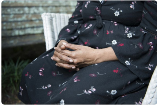
3:00 PM - 8 Dec 2018

“My first week in the refuge was amazing. The first thing they did was show me my unit, they said this is where you will live for your time with us. I opened the door and I cried. Because before I was homeless, I had no idea where to go.” #16days #hearmetoo #orangetheworld